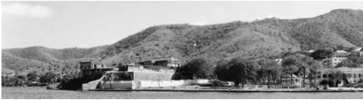
Fort Christiansvæn in the 1930s.