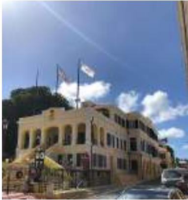
Government House Christiansted