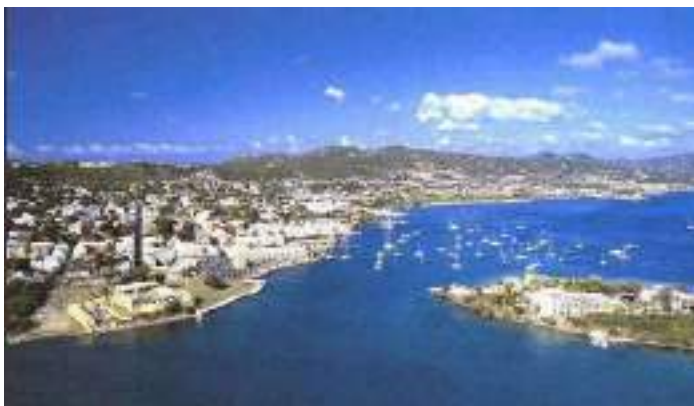
Christiansted, looking westward.