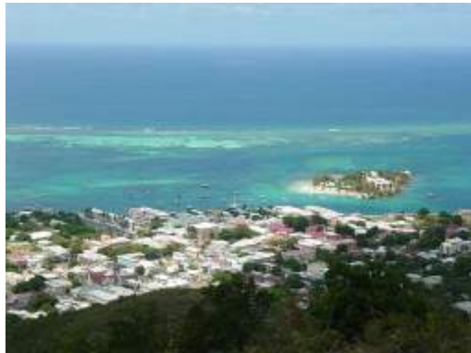
Christiansted, looking north.