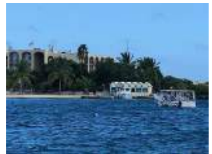
Ferry to Protestant Cay