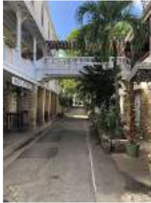
House in Street Christiansted