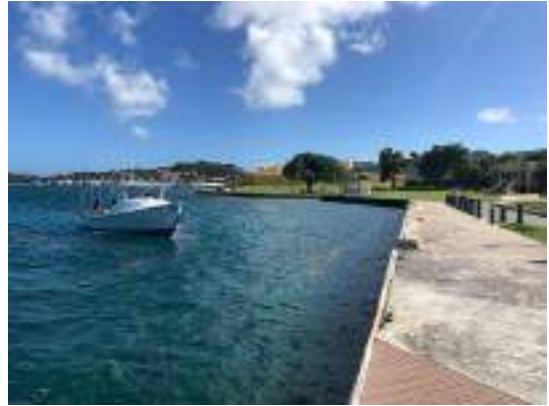
in View at National Historic Site