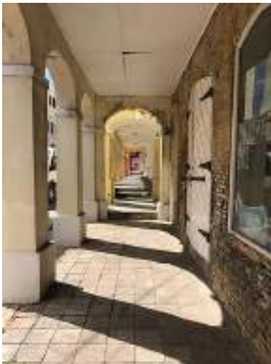
Street in Christiansted