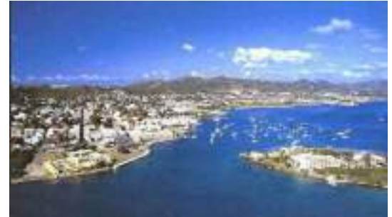
The City of Christiansted looking east